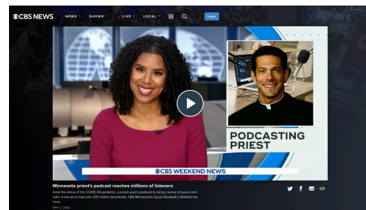
Screen shot: CBS National News, April 2, 2022